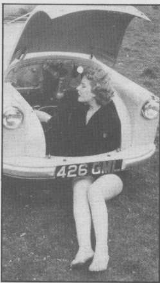
"After this I'll feel a little Frisky"