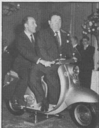
Write a caption, win a camera