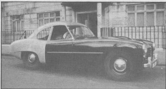
Could this be one of the prototype Swallow Doretti coupés?