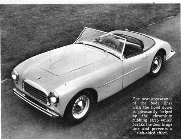
The neat appearance of the body lines with the hood down is pleasantly helped by the chromium rubbing strip which breaks the door hinge line and prevents a slab-sided effect.