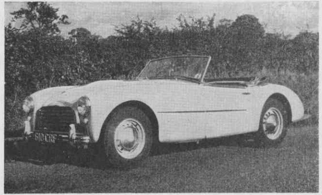
HANDSOME LINES characterise the Vanguard-engined 2-litre Doretti two-seater.

One of the Doretti's outstanding features is the Bishop cam steering, which is very light and smooth; it transmits no reaction or vibration but some column float, and is quick and accurate, with keen castor action. It enables the best use to be made of small gaps between obstructing vehicles, and is reasonably high-g geared.