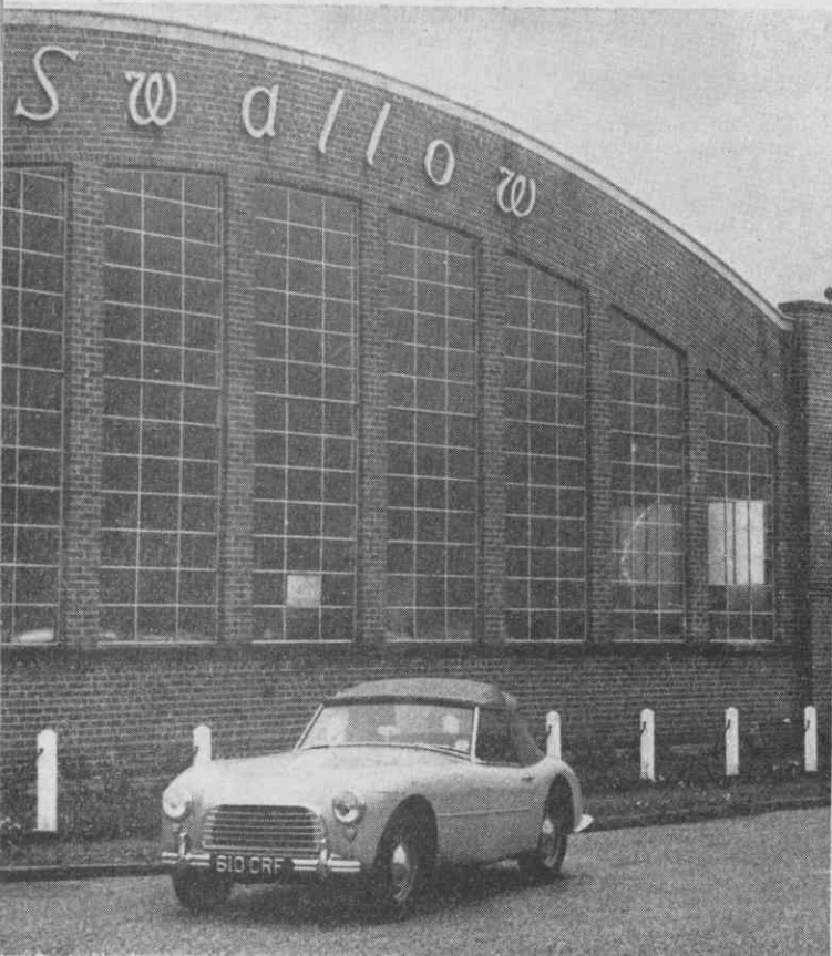
AT HOME.—A Doretti standing outside the Swallow Coachbuilding factory at Walsall, Staffordshire.

A Smart, Nicely-Finished, Lively 2-seater with the Well-Established Two-Carburettor Standard Vanguard Engine